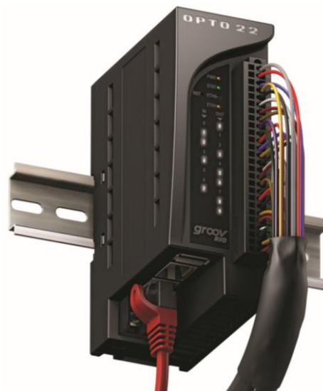
groov RIO

With its foundational EPIC technology in place, the company assembled a comprehensive product portfolio purpose-built to bridge industry gaps. Opto 22's portfolio includes RIO, a revolutionary I/O field-to-cloud, standalone connectivity solution introduced in 2020 that offers 200,000 unique, software-configurable I/O combinations in a single, compact, industrial package with web-based configuration, commissioning, and built-in IIoT software. The company designed RIO to communicate data between devices (field, on-premises, and cloud) and destinations as an edge I/O unit. Like EPIC, it is ATEX-compliant and can perform in extreme and hazardous conditions (-20 °C to 70 °C operating temperature range). RIO connects to and acquires data directly from sensors, equipment, and systems, making the information readily available for on-premises or cloud applications, databases, and other software, leveraging Node-RED. The device also acts as traditional remote I/O, configuring the I/O through the user's control program. Additionally, Opto 22 designed a RIO model for customers leveraging Ignition from Inductive Automation (GRV-R7-MM2001-10), which is a 10-channel, multi-signal, multifunction remote I/O unit that has two switched Gigabit Ethernet interfaces in its communication processor. 3