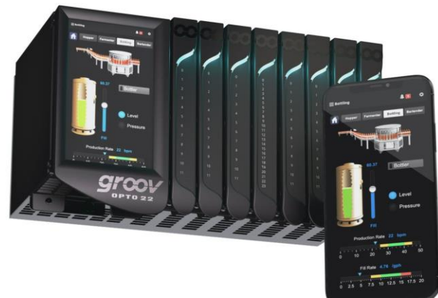
groov EPIC

Backed by world-class subject matter experts, Opto 22 developed EPIC (which stands for Edge Programmable Industrial Controller) over several years before its 2018 product launch. The company refined its holistic approach to industrial control systems, building on its innovation excellence to deliver an industry-first edge programmable industrial control system that delivers ease of use, cost efficiency, high security, and powerful performance. Designed and purpose-built to meet the needs of automation engineers, EPIC's hardware offers a state-of-the-art quad-core processor and guaranteed-for-life I/O, enabling key use cases, such as remote monitoring, process control, data acquisition and processing, and IIoT. Opto 22's goal with EPIC was to create a cohesive system that offered significant features, such as streamlined data exchange with other systems, mobile/web visualization, edge computing, ATEX compliance, and the ability to perform in extreme and hazardous conditions (-20 °C to 70 °C operating temperature range). The company combined these features with real-time control and industrial I/O, resulting in an easy-to-use, secure, and high-performance control system that outperforms the competition in holistic agility, versatility, and performance. Opto 22's strong intellectual property portfolio upholds its technology, placing a high barrier to entry for emerging competitors.